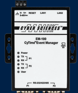
CyTime Event Manager