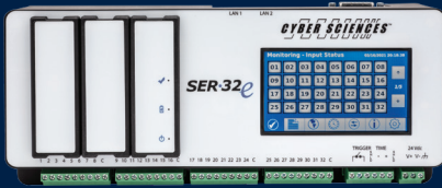
CyTime Sequence of Events Recorder

Cyber Sciences is the global leader in precision time solutions for critical power facilities, including data centers, hospitals, industrial applications, universities, airports, microgrids, and alternative energy.