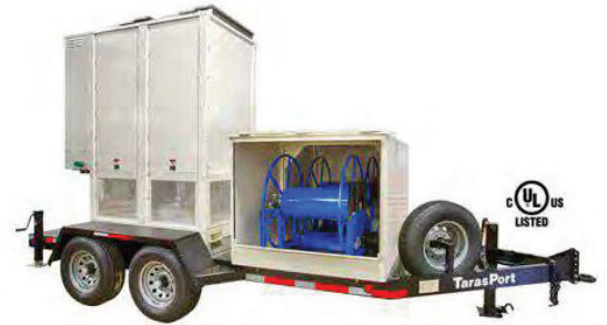
Shown above: LT2500 with optional trailer and motorized cable reel

Integrally mounted blower motor with high-performance, direct-driven fan blades deliver the required airflow volume (CFM) for cooling resistor load elements. Power for the blower circuit can be selected from an “external” power source, or “internally” derived and operated from the main input load bus (source under test).